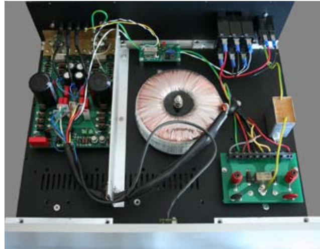
Master inside chassis

Each Master carton should contain (1) one Cello Master power supply (1) one AC cable.