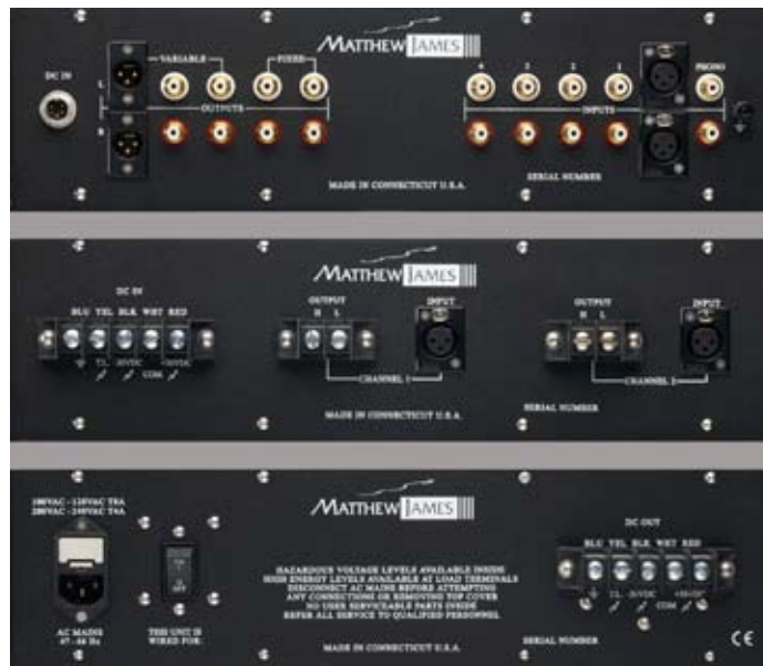
Rear Panels of the Chorale preamplifier, Encore stereo amplifier and Master power supply

A stereo Encore amplifier and a Chorale preamplifier can be powered by a single Master power supply providing state of the art performance at a price seldom associated with such a performance level.