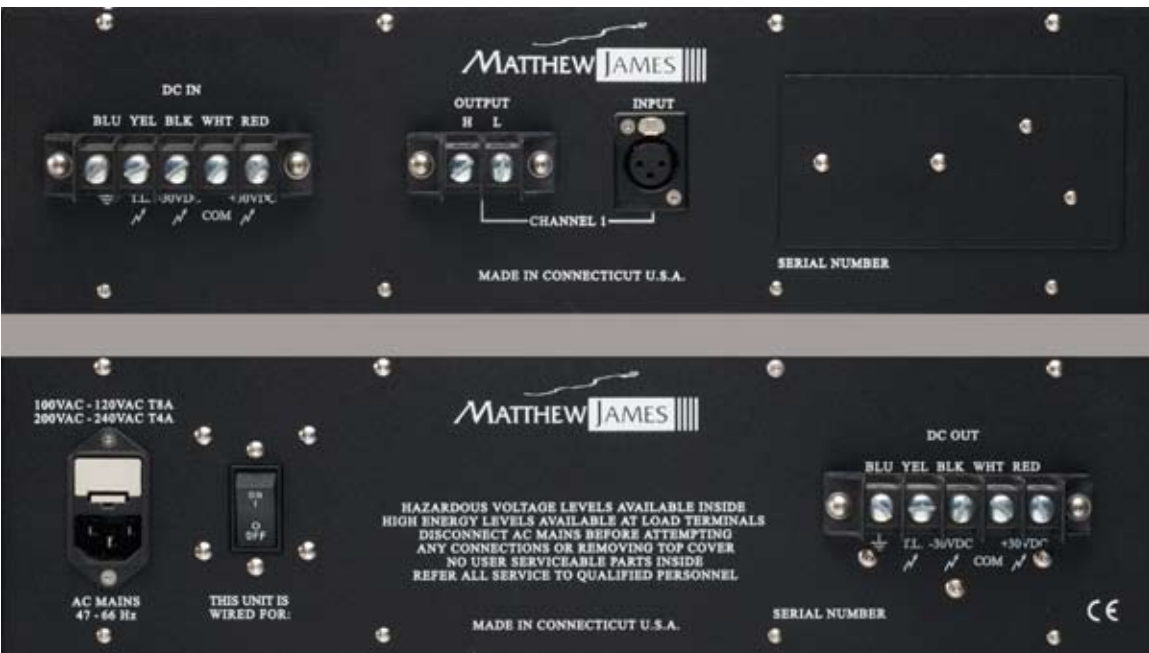
Rear Panels of the Encore mono amplifiers and Master power supplies

Bridging is accomplished internally for both maximum performance and so that the user is presented with a very simple connection.